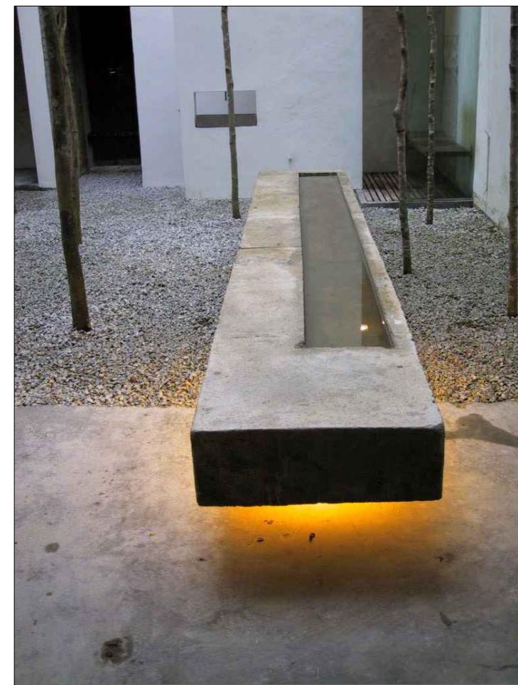
a DETAIL: COURTYARD WATER TROUGH Scale 1:25