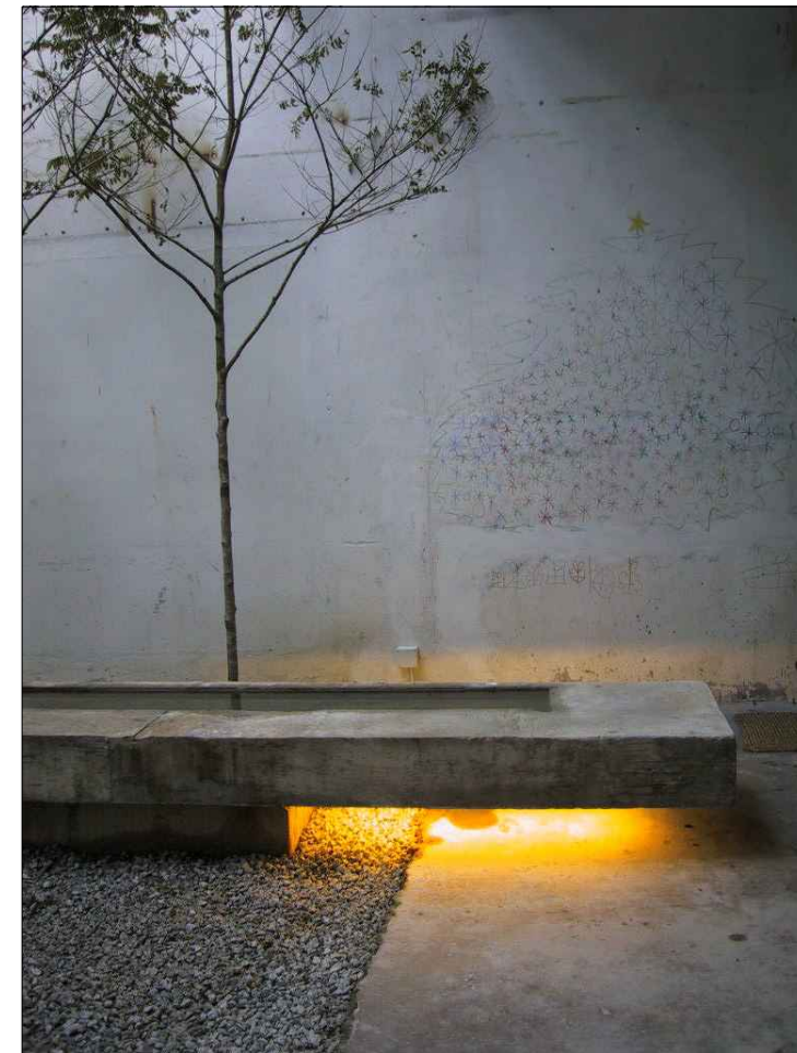
WATER TROUGH IMAGES